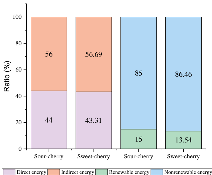
Fig.2. The share of total mean energy inputs as direct, indirect renewable and non-renewable forms in sweet-cherry and sour-cherry production

diesel fuel, agricultural machinery and chemical fertilizers, the sweet-yield was increased to 0.941, 0.290, 0.127, 0.086 and 0.021 kg, respectively.