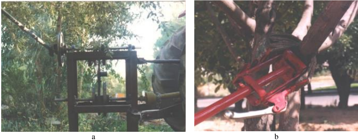
Fig.2. a) Fabricated limb shaker during evaluation in the orchard, b) clamping device with soft pad attached to limb for vibration cushioning.

A limb shaker was designed and fabricated to oscillate the limbs with different vibration modes (Fig.2a). The tractor-mounted fruit harvester received its power from the power take-off (PTO) shaft and transmitted it to the tree limb through a boom and a special clamping device (Fig.2b). A V-belt drive system changed the initial 540 revolutions per minute (rpm), supplied by the standard tractor PTO shaft, to 200-1200 rpm and corresponding frequency ranging from 3.2 to 20 Hz. Five levels of shaking amplitude (4, 6, 8, 10, 12 cm) were provided by a slider-crank mechanism, where rotating motion was converted to a reciprocating motion. The clamping device is a quick fastening type equipped with a soft pad as an intermediate media for the protection of the bark. The machine's overall dimensions are 140×80×100 cm. The machine seats on the ground utilizing a hydraulic system of the tractor.